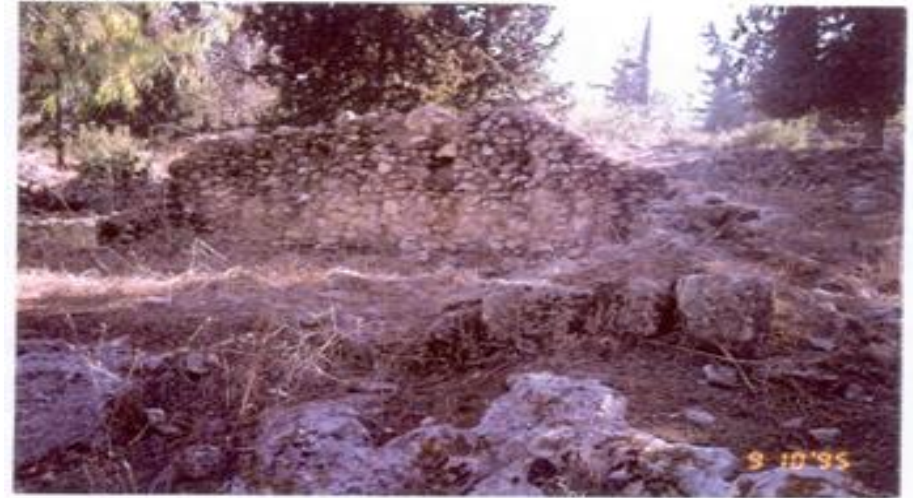
Lubyra's only standing wall

Out of 1000 rooms in Lubyra in 1948, all that remains for refugees, are merely memories of the past & landscape: the vertebral column of their existence.